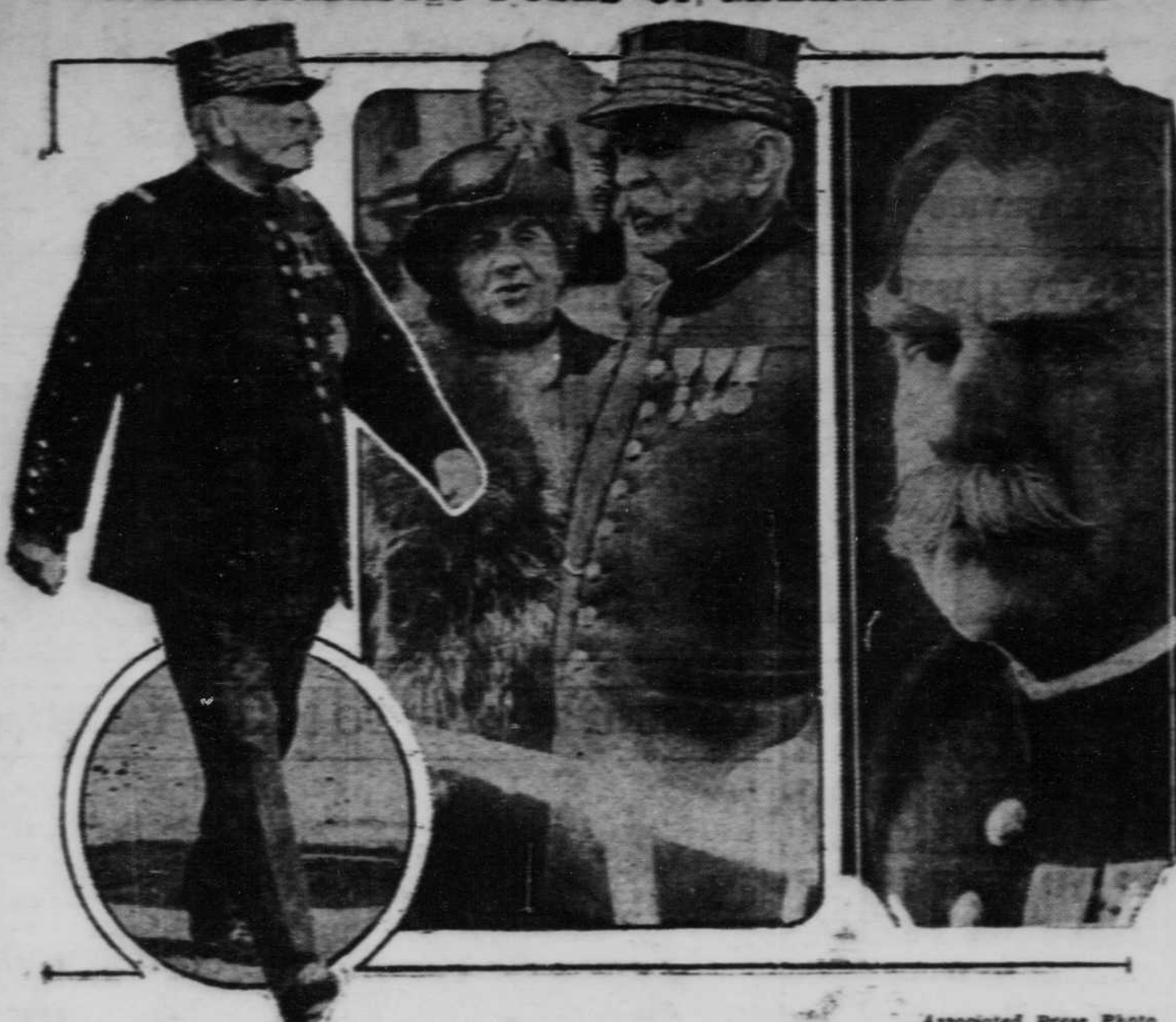
Marshal Joseph Joffre, the savior of France. The picture on the left was taken shortly after the world war. He is shown in the center with Madame Joffre and on the right is a recent portrait.