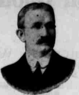
Candidate For Re-Election,