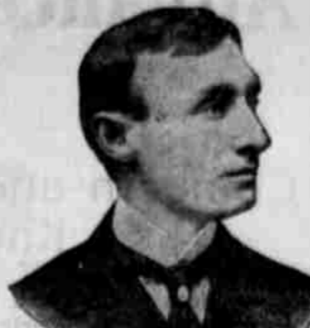
Candidate For Re-Election

THIRTY SIXTH DISTRICT, Comprising Jefferson county First and Second wards, Forty-second to Fifty-third precincts of Third ward, Twenty-seventh and Twenty-eighth of Fifth ward, Forty-ninth and Fiftieth of Seventh ward, Thirty-sixth of Eleventh ward, and Thirty-second to Forty-first of Twelfth ward. Subject to the Action of the Democratic Party, Primary Election August 2, 1913.