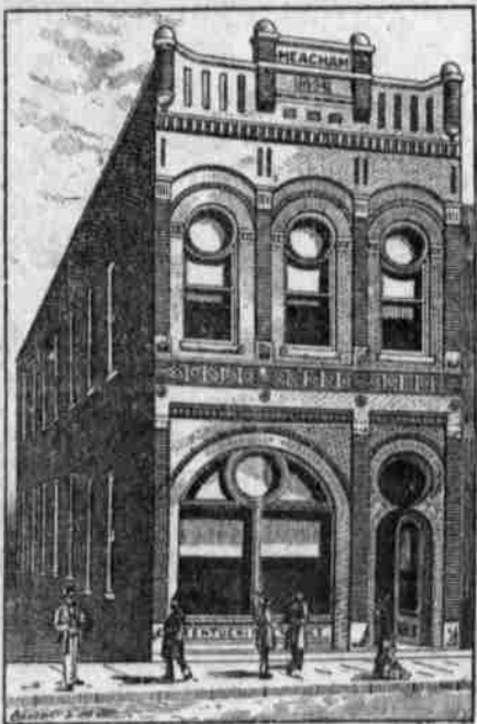
Kentuckian Bldg. 212 S. Main! Tele. 99-2.

The Kentuckian is published every evening except Sunday and every department of the paper is supplied with a news service that cannot be surpassed in all Western Kentucky.