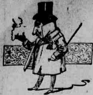
IT'S NOT WORTH MENTIONING

or eating, because everybody knows we are Headquarters for Groceries. This is no equally on account of the extent of our stock and the quality of our goods. Quality comes first in articles of food—in fact, it's of so much more consequence than any other consideration that it's really the only point worth talking about. What you eat must be reliable, and it must be A. 1. at that. Health and satisfaction require it, and both are assured to all our customers.