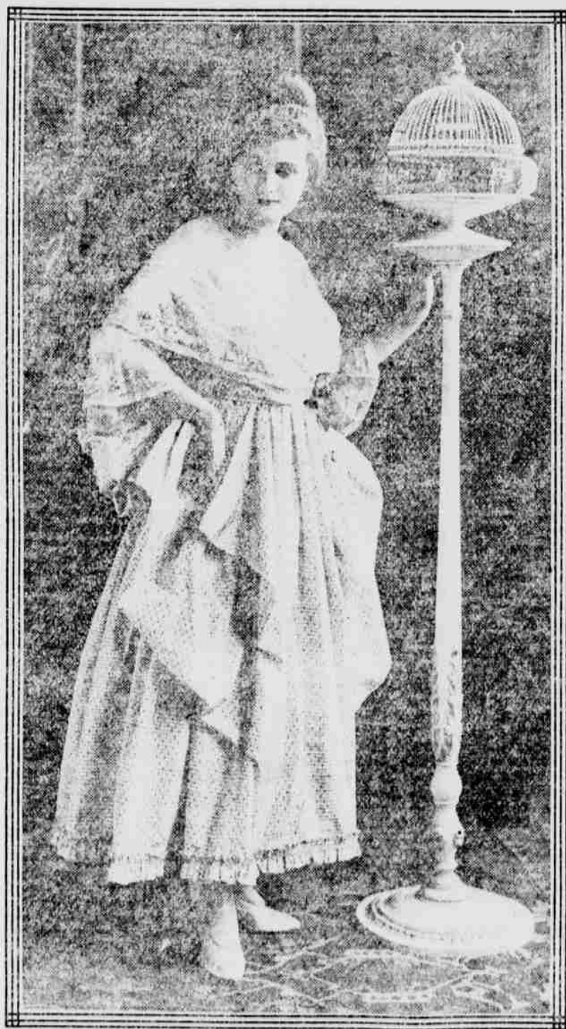
A Gay Little Dinner-Dance Frock is in Order by Six O'clock

The type of smart tub frock which may, if one prefers, take the place of ordinary sport attire, is illustrated in another picture. This is the new "pinafore" model adapted from a poultice creation which employed silk, not a tub material in its achievement. As pictured, the frock is of tan colored linen embroidered with white worsted in a boldly outlined border pattern, a large square of the linen forming the "pinafore." Above the waistline the square—on one point it is applied to the bodice (the fastening coming at the back) and at the waistline rows of smocking hold the material in, to the figure, giving the pinafore much fullness over the skirt. The material has been slashed