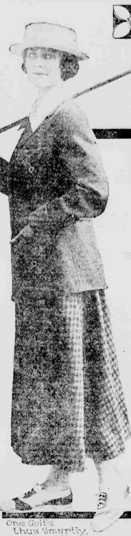
One Golf's thus Smartly, in the Afternoon

Everybody will dress up elaborately for dinner—be sure of that and prepare accordingly. The woman who trails around the golf links all day in a badly cut plaid skirt and weather beaten jacket may appear at dinner hour in the most brilliant costume in the room. A black evening gown is always a wise choice and one woman who makes many week-end visits has two under-dresses for her black silk dinner gown; one mostly tulle so that the effect is very decolete; and the