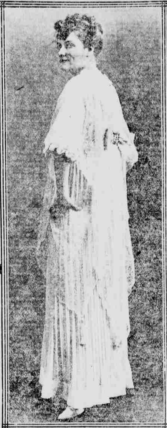
Breakfast in One's Room in a Ravish- ing Negligee Between Nine and Ten

a tie of braided white worsted with tasseled ends. The tan linen frock is accompanied by white canvas sport shoes, a white crin hat trimmed with white silk and gardenias, and a parasol in tan, green and white.