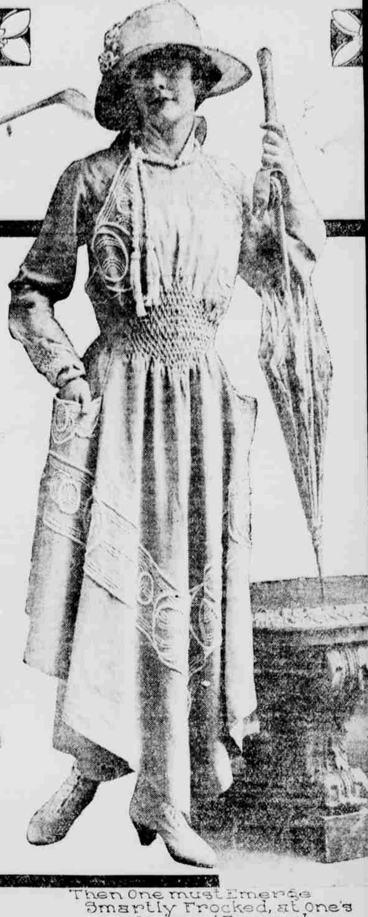
Then One must Emerge Smartly Frocked, at One's Hostess' Disposal