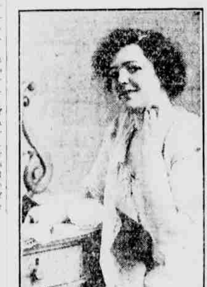
A dab of powder is not enough; face, throat and neck must be carefully gone over.

MOST women roll up their hair in a bathing cap and tuck their necks into the silk kerchief for easy drying, and some ingenious soul, in this conceived the idea of a bathing cap that could be turned in at once into a convenient bag. The was carried out and now any woman may possess one of these practical swimming accessories. The bag is teen or sixteen inches long and a deep heading drawn up on tapes or ribbons at the open end, opposite end is shaped to an oval. Midway of the bag is a tuck through the upper half of this tuck elastic is shirred. When it is desired to turn the bag into a cap, the bottom of the bag is pushed up inside the shirred tuck with its elastic becomes the edge, with a becom full around the face. The heading at the top of the bag, drawn up on tapes or ribbons, makes a fluffy cushion at the top of the head.