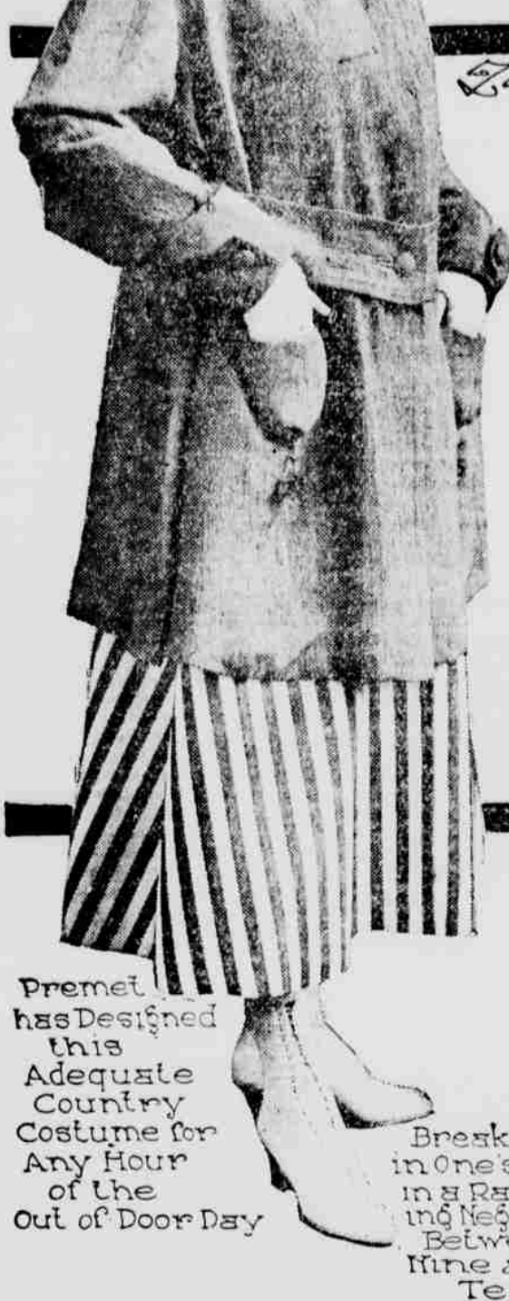
Premet has Designed this Adequate Country Costume for Any Hour of the Out of Door Day