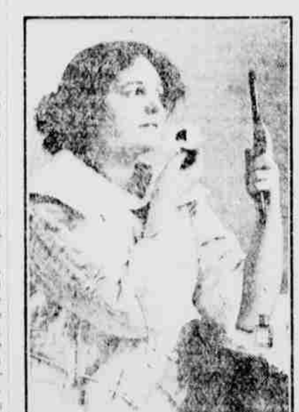
Always apply cosmetics in the strongest possible light—for by such you will be judged later on.

In a clear, unshaded light—daylight, (not soft artificial light!) push your hair back from your forehead and tie it there with a bit of ribbon. Yes, I know it is hard to look at your face thus cruelly exposed to a glare of light and absolutely unsoftened by the coiffure, but there is nothing more dangerous than an application of make-up in a dim light.