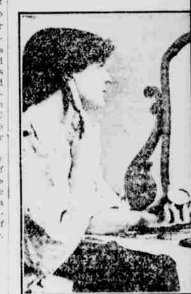
It is a careless woman who for that rosy ear-lobes are the sign of health, youth and vitality.

intently colored to bring it forth. After the rouge a liquid powder is applied and through this the rose of the rouge gleams naturally. A white finish should never be used the daytime and few women are fair that they can stand it any the liquid finish should be select match the general tone of the complexion and must be rubbed down a lamb's wool puff or a bit of absorbent cotton, all over the face and under chin and jaw, and also on the