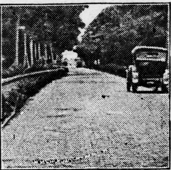
A Brick Road in Pennsylvania.

There are places in Pennsylvania where it costs more to haul farm products to a railroad station than it does to pay the freight to France. As in the past, the hope of the future from a moral point of view, is to maintain a happy, contented and prosperous people on the farms and in the small towns and villages. They don't produce I. W. W.'s, ballot-box stuffers, election fraud crooks, gun-