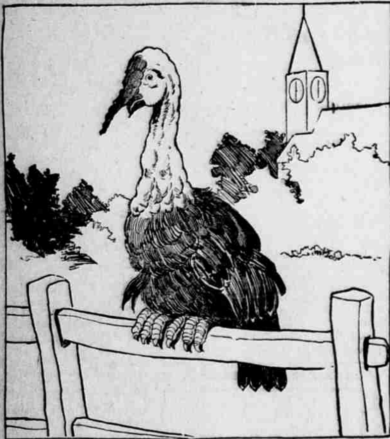
"Six o'clock and still on the fence."