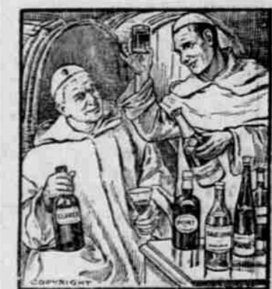
Superior Liquors and Wines for the