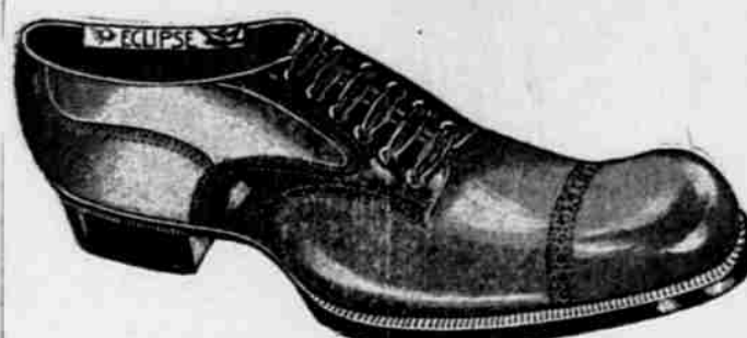
Men's Vic Oxfords on the new Toe as above Price $2.50 to $3.50.