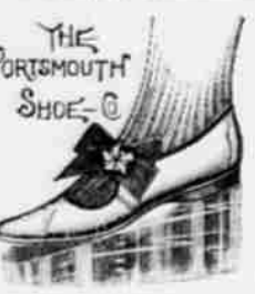
Child's Bow Slippers, Pat. Kid, Sizes 8 to 11 1-2, Price $1.25.