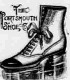
Child's High Cut Patent Leather or Dongola. Size 8 to 11 Price $1.25, $1.50, $2.00