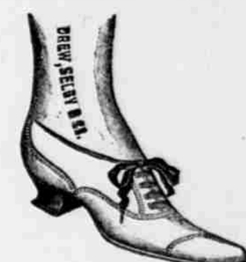
Ladies' Dongola Pat. Tip, Military Heel, sizes 2 1-2 to 8. Price $1.50.

Every Shoe in Our Store You Will Find to be Correct and all New.