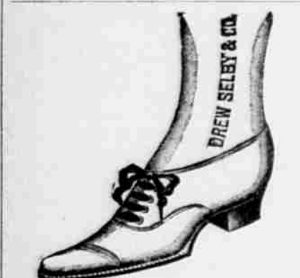
Dongola Pat. Tip, Low Heel, Price $2.00.