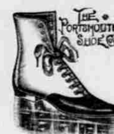
Misses' Pat. Kid Shoes. Quite New and Stylish. Price $1.50 to $2.00.