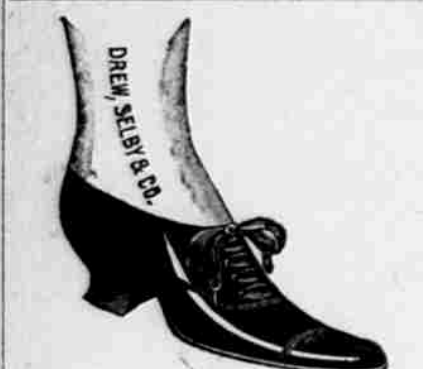
Ladies' All Pat. Colt. Quite the thing; all sizes. Price $2.00.