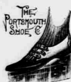
Child's Strap Slippers, Size 6 to 8. Price $1.00 Same in 8 to 11, Price $1.25 Same in size 11 1-2 to 2, $1.50