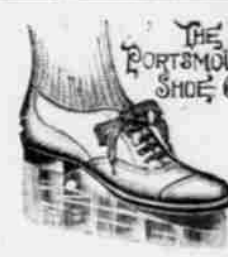
Child's Welt Oxford Sizes 8 to 11. Price $1.50. Same 11 1-2 to 2, $2.00.