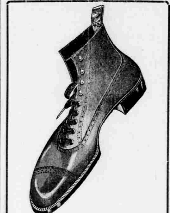
Our Stock of Gent's Shoes, well-known makes and all the best styles. $1.50, 2.00, 2.50, 3.00, 3.50 to $6.00.