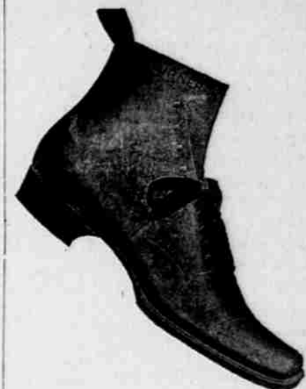
The Celebrated Turnover Shoe. The best we know of; to be had here Price $5.00, $6.00.