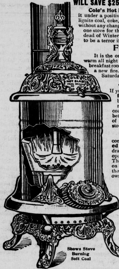
Shows Stove Burning Soft Coal

Cole's Hot Blast makes $5.00 worth of fuel give more heat than $10.00 worth in any other stove. Sold on a positive guarantee. Investigate today.