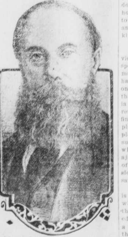
Lionel Sackville West, who was recalled while British Minister to the U. S. in 1888, has just died after a long illness.