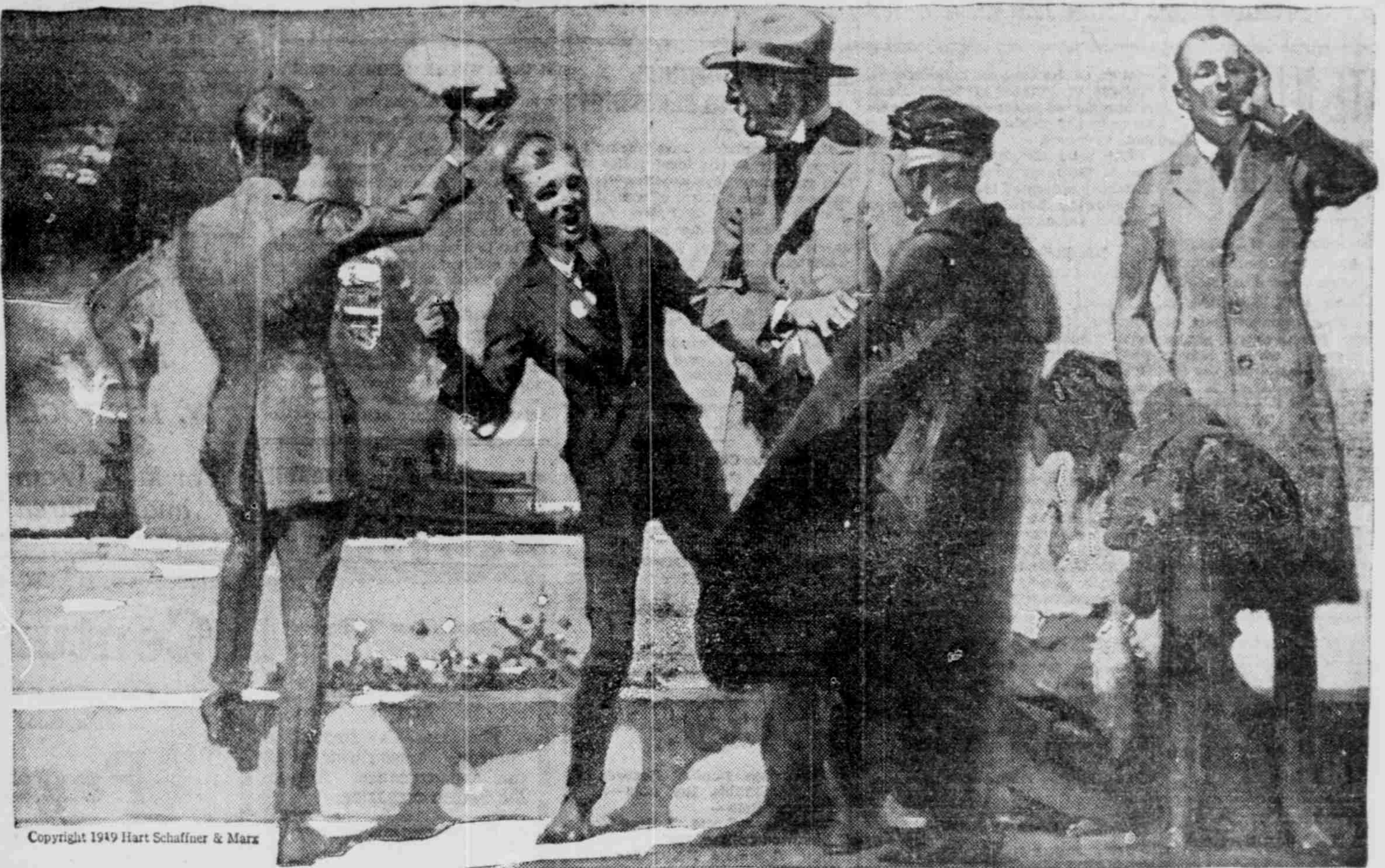
Copyright 1919 Hart Schaffner & Marx

One of the new waist-seam suits; single and double-breasted models; ready to show you. The style hits of the season.