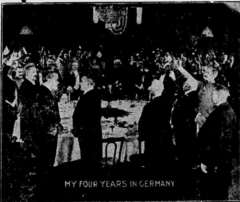
MY FOUR YEARS IN GERMANY

The greatest of all patriotic pictures, "Ambassador Gerard's 'My Four Years in Germany'" is to be shown at both the Idle Hour and New Theatres in Leon on Monday and Tuesday, July 29 and 30. This is a picture of Mr. Gerard's famous book, "My Four Years in Germany." It is a page from American history. It is fact, not fiction, and every man, woman and child should see it. It is an official authorized production of Ambassador Gerard's book and embodies strikingly the case of the United States against Germany—why we are fighting Germany. It shows the