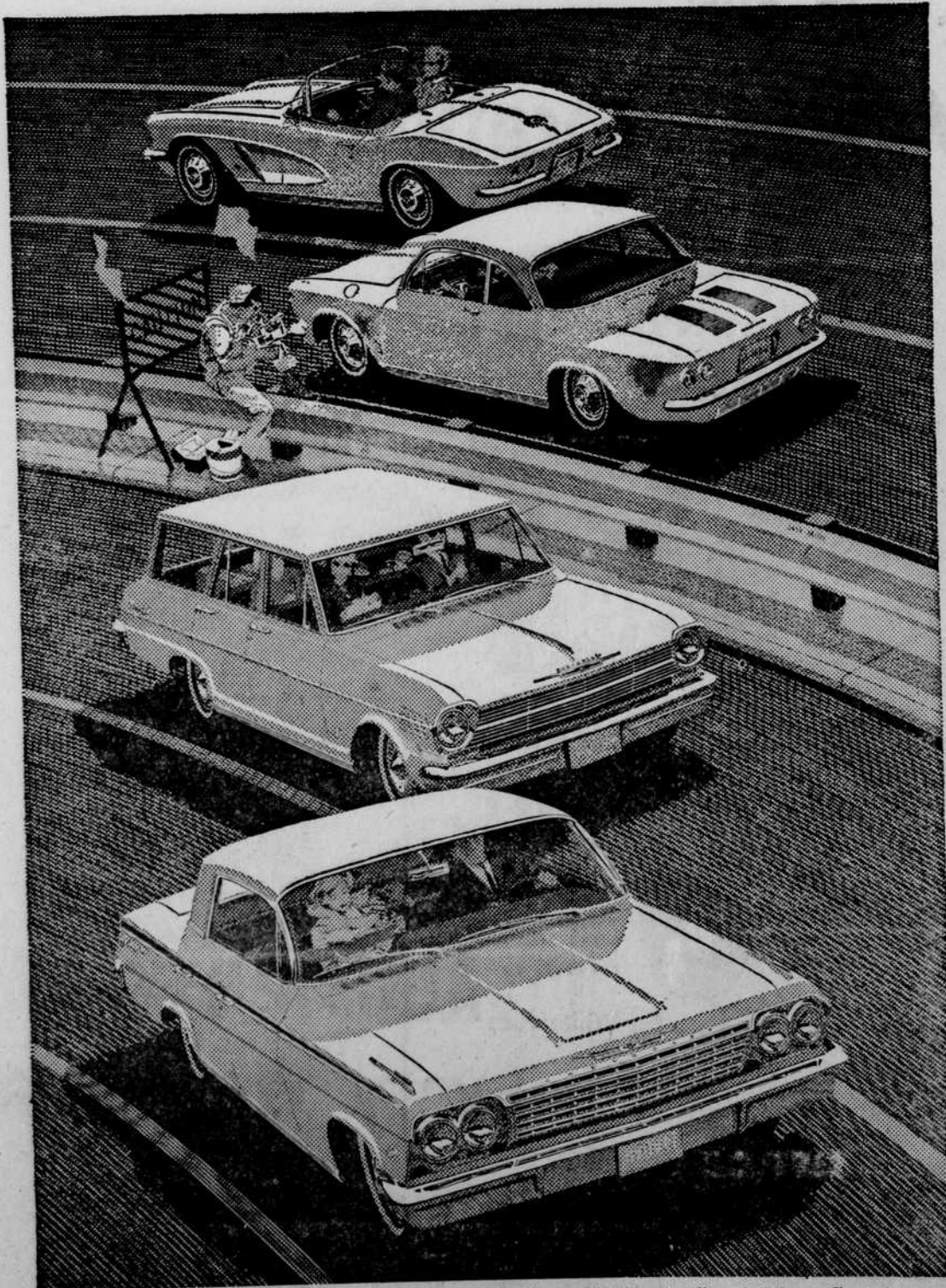
Four Sun 'n' Fun ways to get away (shown top to bottom) are the Corvette, Corvair Monza Coupe, Chevy II Nova Station Wagon and Chevrolet Impala Sport Sedan.

Now, beautiful buying days at your local authorized Chevrolet dealer's Golden Sales Jubilee!