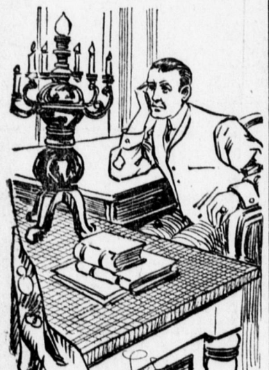
For an Instant He Stared Unbelievingly.

Sunset found Vallant sitting in the music-room before the old square piano. In the shadowy chamber the keys of mother-of-pearl gleamed with dull colors under his fingers. He struck at first only broken chords, that became finally the haunting barcarole of "Tales of Hoffmann." It was the air that had drifted across the garden when he had stood with Shirley by the sun-dial, in the moment of their first kiss. Over and over he played it, improvising dreamy variations, till the tender melody seemed the dear ghost of that embrace. At length he