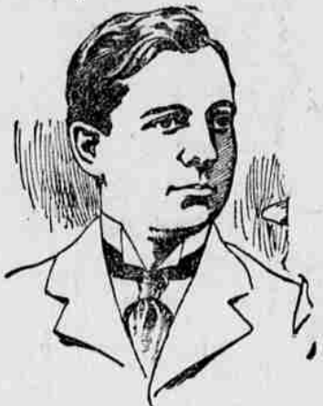
FRANK O. LOWDEN.