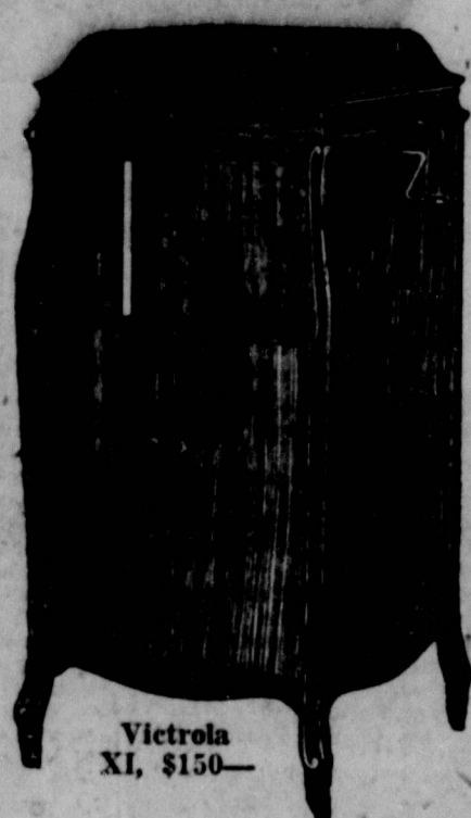
Victrola XI, $150—