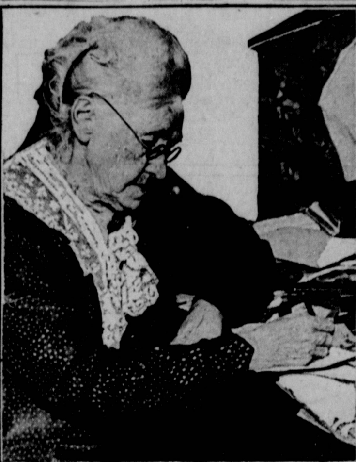
Mrs. W. H. Felton, 87, appointed by the governor of Georgia to fill the unexpired term of Senator Thomas Watson, deceased, shown at work in her study at Cartersville, Ga.