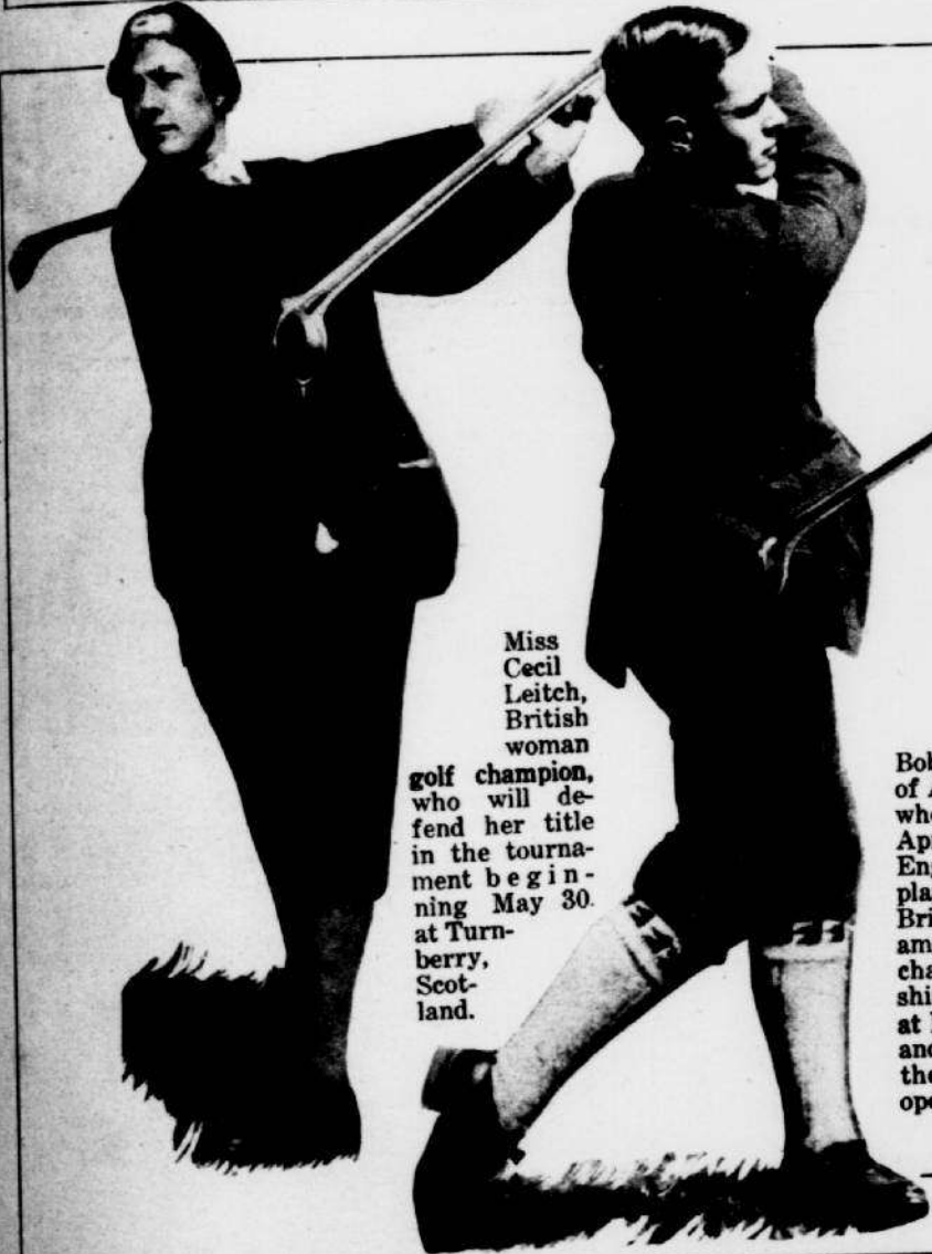
Miss Cecil Leitch, British woman golf champion, who will defend her title in the tournament beginning May 30, at Turnberry, Scotland.