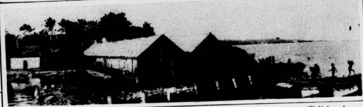
THE ISLAND OF YAP. Japan denies the claim of the U. S. to this little island.