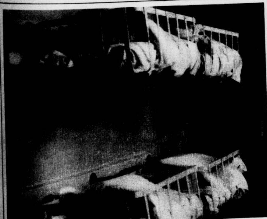
NO MORE MIX-UPS OF NEW BORN BABIES. In the Bronx Maternity Hospital each little baby is properly marked and put in its individual crib, which is attached to the wall in a novel manner.