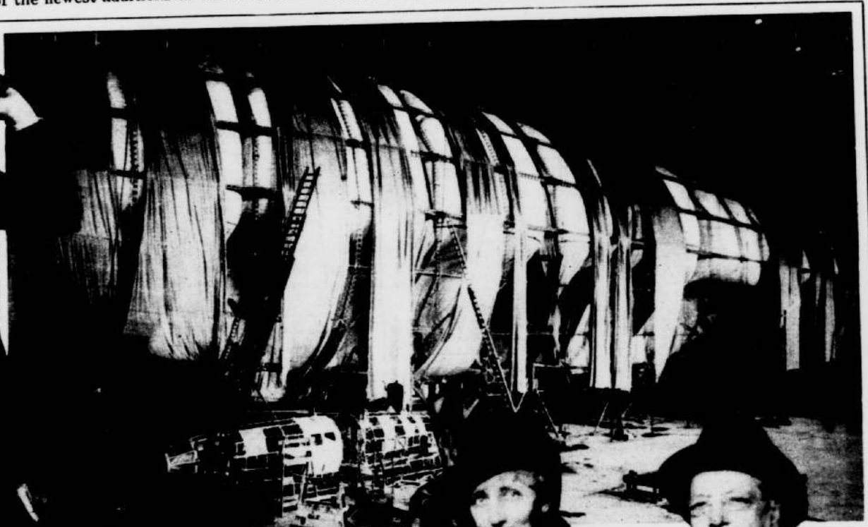
THE DIRIGIBLE R-38, now being constructed for the U. S. at Bedford, England. It will fly to America some time this summer.