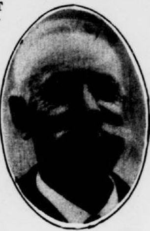
PRINCE ALBERT OF MONACO arrives to receive the Agassiz Medal.