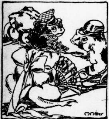
"I Am Much Larger."

"I am much larger than you are," said Miss Tessie Toad to Teddy Toad, "and I am also larger than you are," she said to Timmie Toad. "We lady