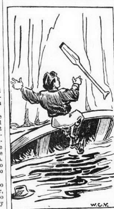
The Boat Capsized.

In telling of the trip Russell said: "The river below Bright Angel for 150 miles was so rough that I never expected to get through alive. If Niagara is worse than Diamond Creek Rapids it must be more than rocks and water. After the damage to the