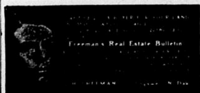
Farman's Real Estate Bulletin