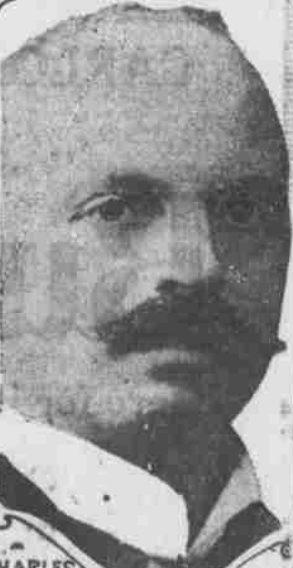
CHARLES ROYS DE BEERENBROECK

This is Holland's premier, who says William Hohenzollern has right of sanctuary in Holland and that Holland will not turn him over to any other nation. Beerenbroeck is entering upon a tough job administration which will not be helped by his declaration.