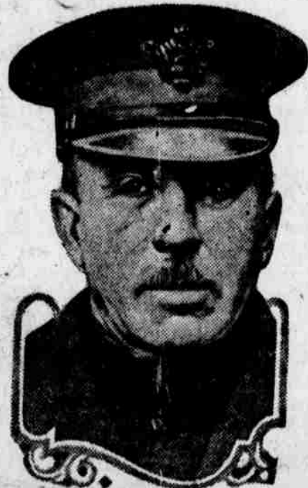
MAJ. GEN. LEONARD WOOD