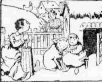
Farmer's Wife—They were born the same day. Neighbor—Twins, in fact.

Assorted chins in the Family Size Package