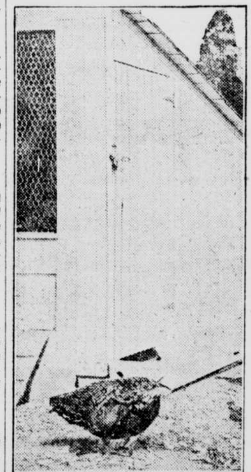
An Inexpensive Open-Front Hen House.

The walls may consist of (1) one thickness of boards, matched or unmatched; (2) one thickness of boards,