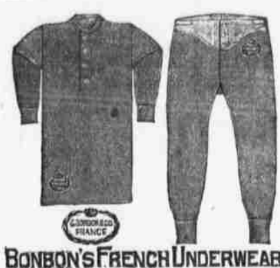
BONBON'S FRENCH UNDERWEAR