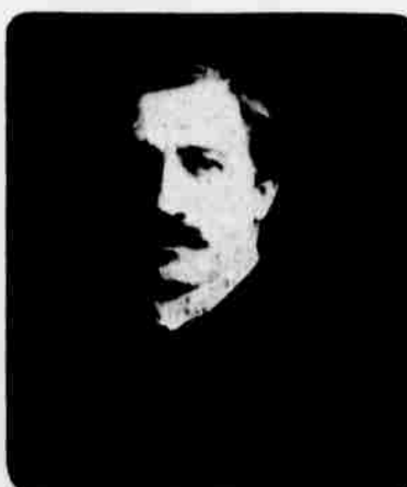
Dr. Frederick A. Cook

Once upon a time, not very long ago, the desire to explore and reach the North Pole, raged tempestuously in the breasts of a very few men, not women, and as the whole world knows Dr. F. A. Cook became inoculated with this self-same desire. He went further north than any man in Holt ever expects to go, and, by the way, he went after Peary in a very different way, however. He will tell the people his own story on the afternoon of August 9th. Don't fail to hear him.