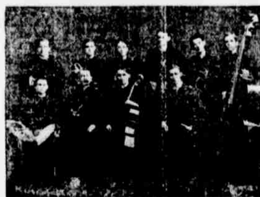
The National Band