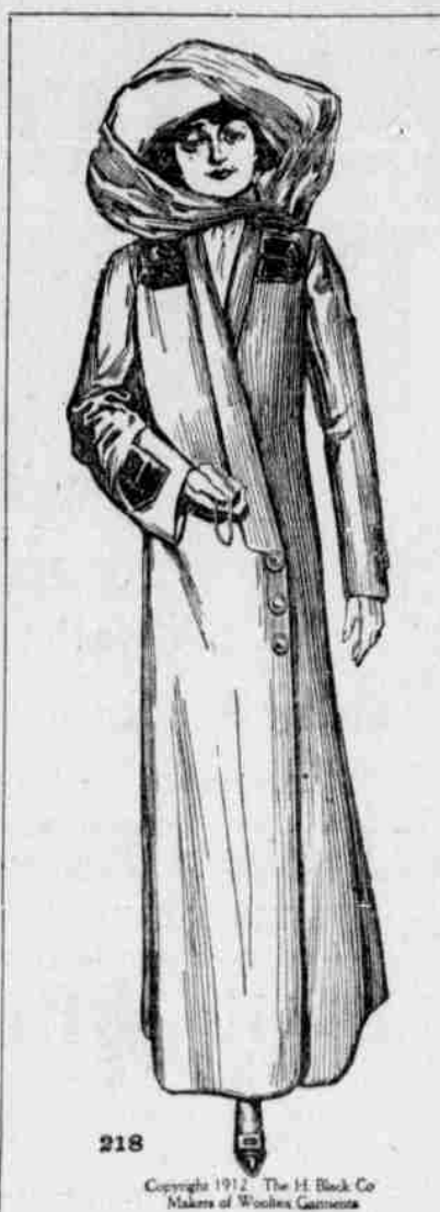
218 Copyright 1912, The H. Black Co. Makers of Wooltex Garments

May not always be the lowest or even as low as you have found on certain articles but we do claim that on an average you can get more for your money here. This is one reason for this statement. Our assortment is by far the largest of any dry goods store in this part of the state and for that reason alone you can best accommodate your wants at our counters. Our stock is now five thousand larger than last season. This means a better place to buy your dry goods and garments. The size of our garment department makes other departments look pretty small. Our garment department is one of the largest in Vermont.