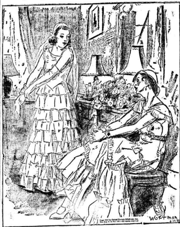
"I just feel he's going to be the nicest husband I ever had."