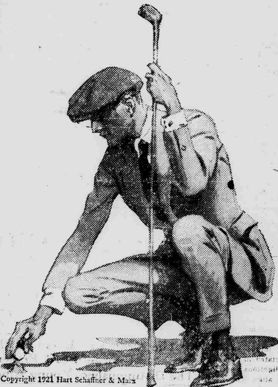
Copyright 1921 Hart Schaffner & Marx