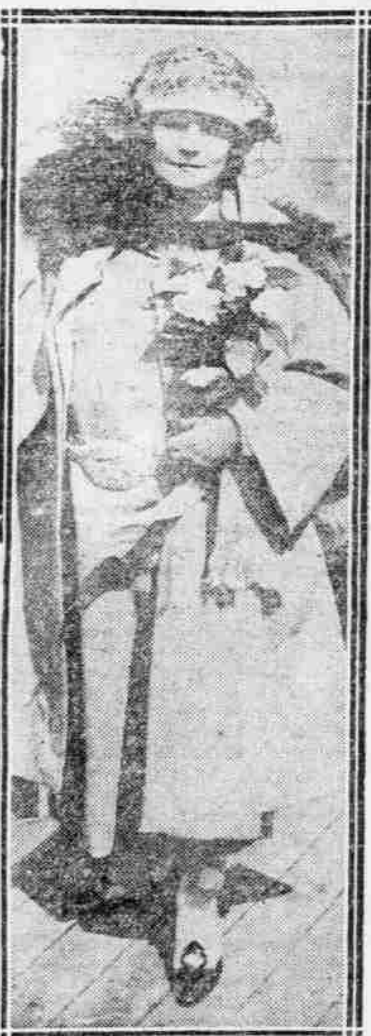
ELINOR GLYN, famous authoress, has returned to her native England after a long period in the movies.