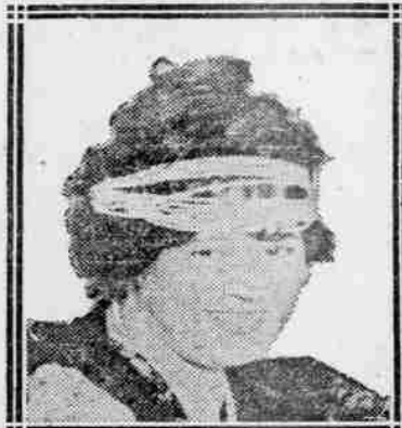
AMERICANS BEST HUSBANDS, is the decision of Princess Rhoda Ateresco, Rumanian splinter.