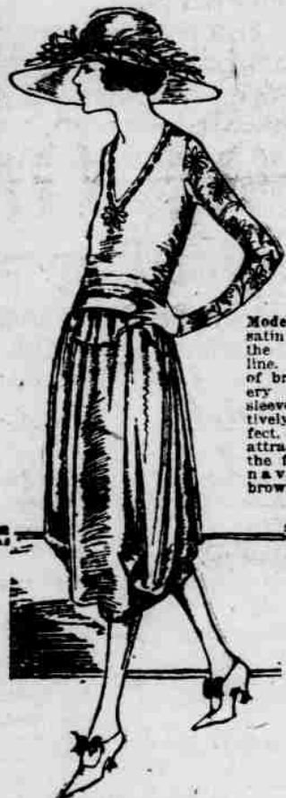
Model 152—This satin frock affects the most recent line. The touches of bronze embroi- dery at neck and sleeves are sug- gestively French in effect, and equally attractive whether the frock is black, navy blue, or brown. $55.00

We need only announce they're here— Read the descriptions— All sizes, all new colors