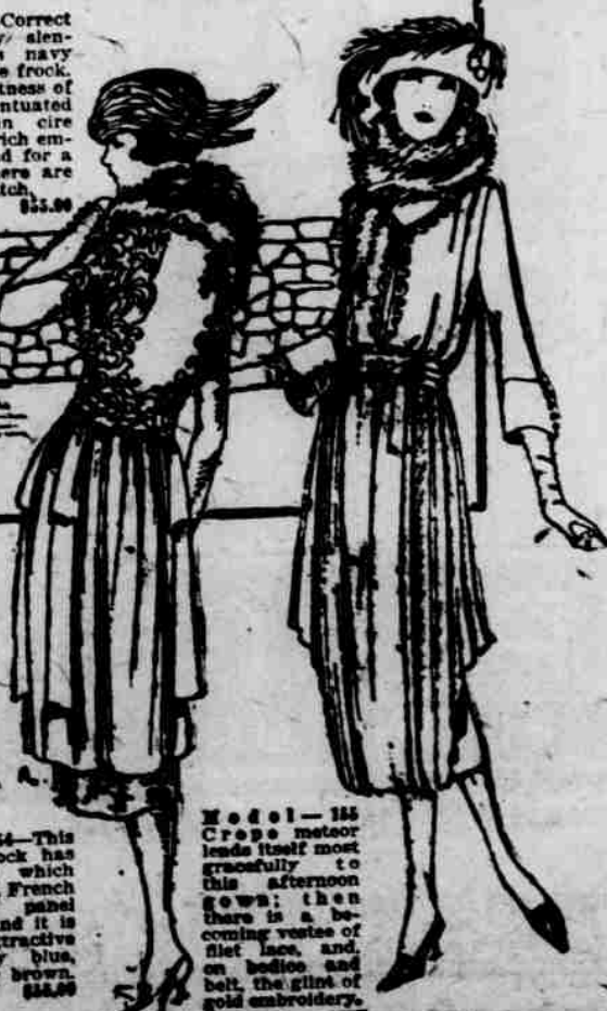
Model 154—This satin frock has a tunic which attains a French air by panel loops; and it is most attractive in navy blue, black or brown. $55.00

VISITORS to Mississippi Valley Fair and Exposition are cordially invited to Davenport's Foremost Store for Women