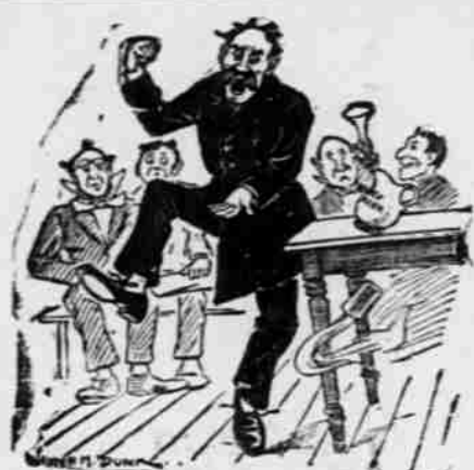
A Complete line of

Saloon Lunches. Free lunch at the Gem saloon, 305 Twentieth street, morning and evening. The best way to avoid sickness is to keep yourself healthy by taking Hood's Sarsaparilla, the great blood purifier. Don't Tobacco Spit and Smoke Your Life Away. To quit tobacco easily and forever, be magnetic, full of life, nerve and vigor, take No-To-Bac, the wonder-worker, that makes weak men strong. All druggists, 50c or $1. Cure guaranteed. Booklet and sample free. Address: Sterling Health Co., Chicago or New York. Subscribe for THE ARGUS.