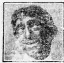
George Primrose Minstrels

Heralded by America's Greatest Singers and Dancing Comedians, GEORGE H. PRIMROSE, And His Own Great Company of the World's Foremost Minstrel Entertainers.