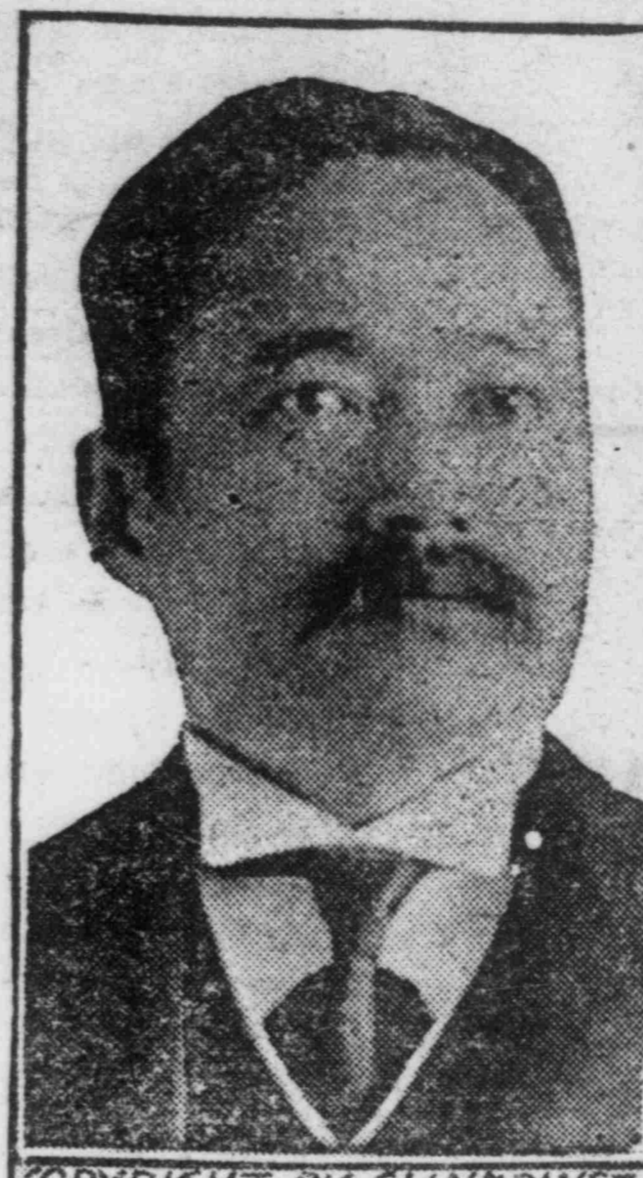
Baron Uchida, the new Japanese ambassador in Washington, formerly represented the mikado at the court of Austria-Hungary.

Baron Uchida, Who Represents Japan Here.