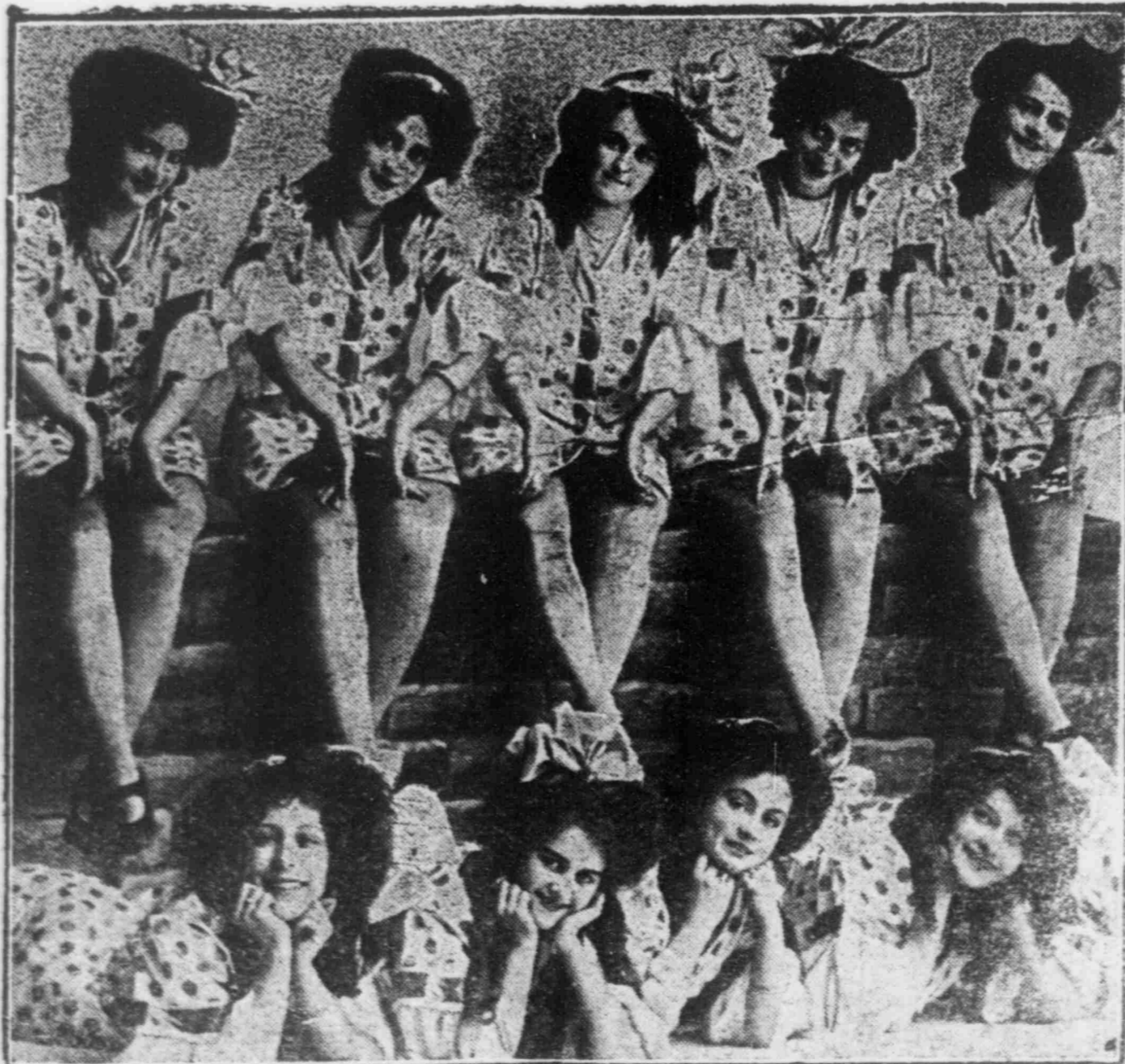
The handsome chorus girls with the Manhattan Opera Company.

One day by way of experiment I harnessed two common garden snails to a toy gun carriage to see if they could pull it along, says a writer in a London magazine. Although the gun carriage was a heavy leaden one, the snails pulled it so easily that I loaded the body of the carriage with small shot. The snails, however, were more than equal to the task. Anxious to test their powers still further, I attached a toy cannon (made of lead and brass) behind the gun carriage, but the snails and their additional load moved on once again with the same apparent ease. Out of curiosity I decided to weigh the cannon, gun carriage and shot and to my great surprise found the total weight to be almost one pound. I venture to think this a very good load for two snails to manage.