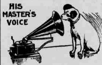
HIS MASTER'S VOICE

I CARRY A FULL LINE OF VICTOR TALKING MACAINES.