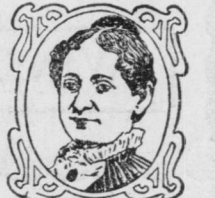
LYDIA E. PINKHAM

For 30 years Lydia E. Pinkham's Vegetable Compound has been the standard remedy for female ills. No one sick with woman's ailments does justice to herself if she does not try this famous medicine made from roots and herbs, it has restored so many suffering women to health. Write to LYDIA E. PINKHAM MEDICINE CO. (CONFIDENTIAL) LYNN, MASS., for advice. Your letter will be opened, read and answered by a woman and held in strict confidence.