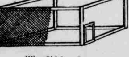
Wire Chicken Coop.

high. It is covered with close woven poultry netting. The wooden strips are two inches square, says a writer in an exchange. The frame as shown requires bracing unless the poultry netting is made diamond mesh and drawn very tight. The door is made by tacking a piece of netting over a light frame. It is easily moved about and the chickens can have fresh ground every day. It will hold fifty chickens and give them plenty of room for several weeks. I put a small box that is roofed over in one corner, which makes a good roost and a shelter from the rain.