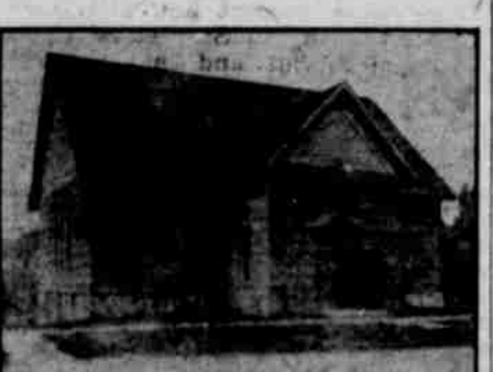
FREE METHODIST CHURCH

At present we are holding special services every night except Saturday in the F. M. Church, situated on the corner of Center and Ionia streets.