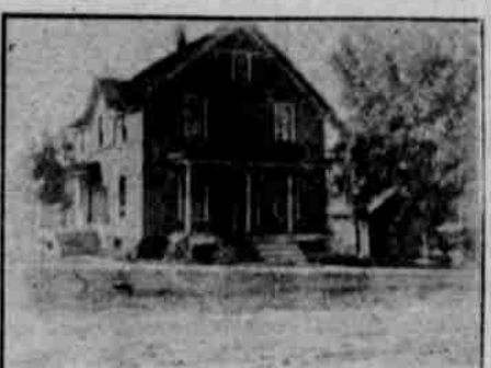
FREE METHODIST PARSONAGE

We are accordingly nicely settled in the very convenient and comfortable parsonage situated on east Ann street number 313.