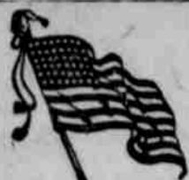
LONG MAY IT WAVE

Advertising rates on application. Card of thanks, one cent a word. Business locals, on first page, 12 1/2 cents a line.