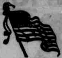
LONG MAY IT WAVE

Advertising Display rates on application. Card of thanks, one cent a word. Business locals, on first page, 12% cents a line.