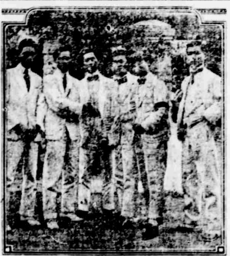
There are hundreds of thousands of this type of young men in the Philippines. They are to be the future rulers of the destinies of the islands.

The Filipino has been much misrepresented in the United States. This is largely because the Sunday supplements have made a specialty of portraying the semi-naked non-Christian hill tribes as "typical" Filipinos, which is far from the truth. The total population of the Philippines is 16,350,940, of which 9,493,272 are Christians and civilized, and have been so for 300 years, possessing a culture and refinement that will compare favorably with that of other countries. The number of non-Christians is 6,857,668, and only a small percentage of these are uncivilized. They are fast becoming educated, and will ultimately make good citizens. Seventy per cent of the inhabitants of the Philippines over ten years of age, according to the last census, are literate. This is a higher percentage of literacy than that of any South American country, higher than that of Spain, and higher than that of any of the New Republics of Europe whose independence is being guaranteed by the Allies.