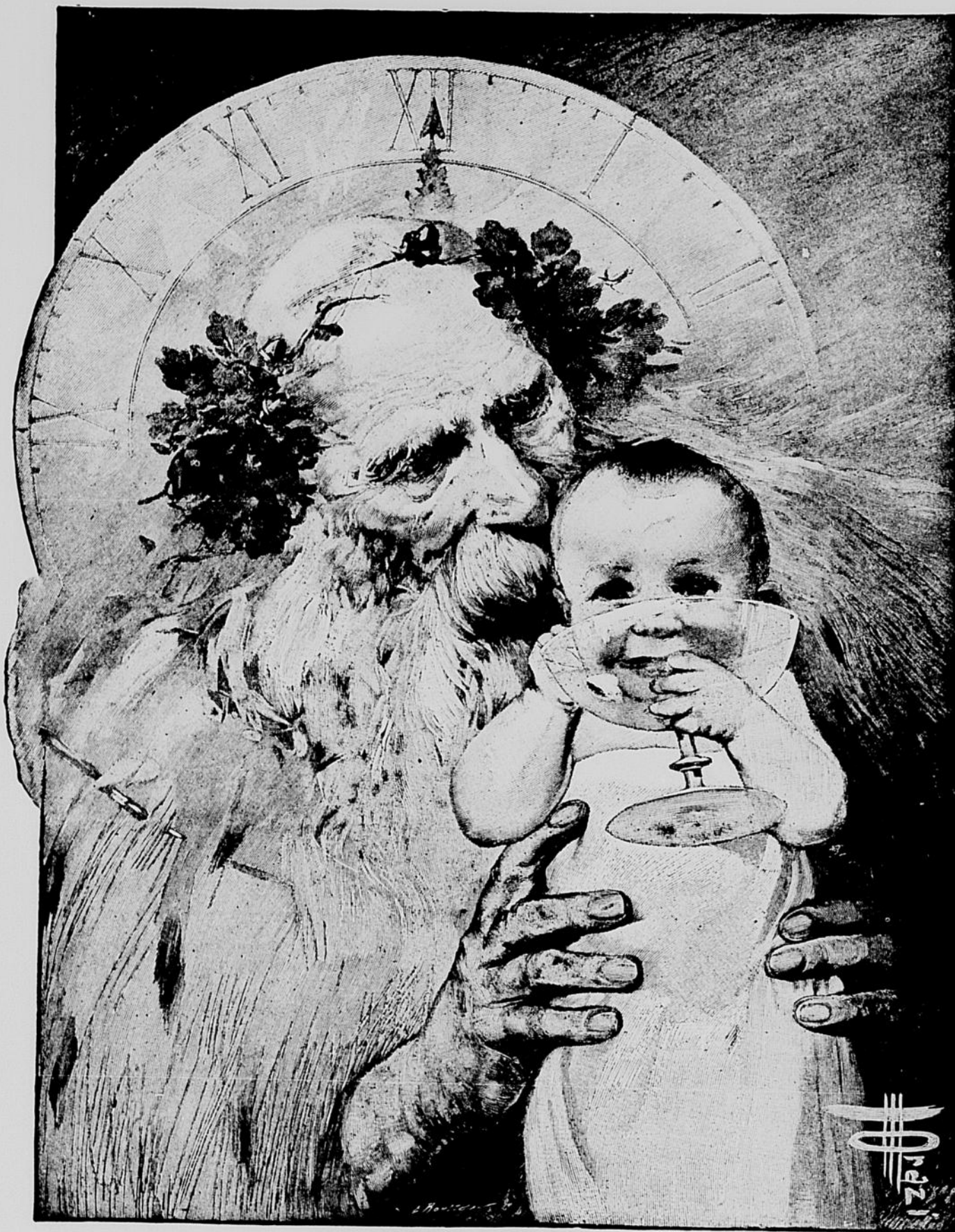
Father Time's New Baby Wishes You a Prosperous and a Happy New Year.